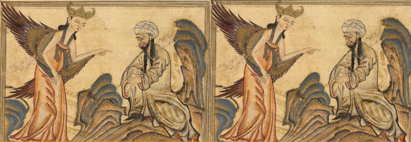
Muhammad receiving his first revelation from the angel Gabriel. From the manuscript Jami' al-tawarikh by Rashid-al-Din Hamadani, 1307, Ilkhanate period.